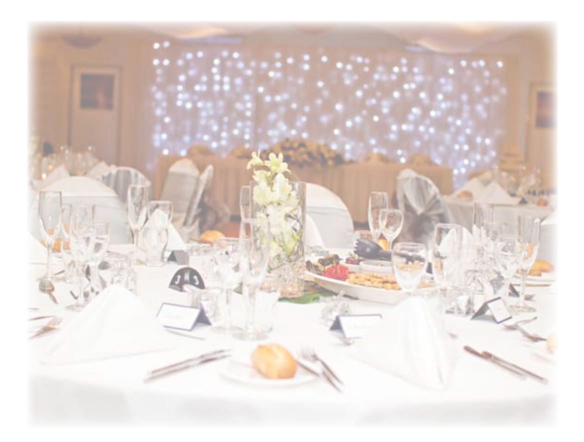
Bankstown Golf Club has an array of Reception packages ranging from cocktail weddings, to extravagant 6 hour weddings. If you have something else in mind, or do not meet the minimum numbers, don't stress! We can tailor a package to suit your needs based on your numbers.